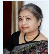
Prof. Sangita Srivastava

It is a matter of great pleasure to learn that the Department of Education is going to bring about the Ninth volume of its Annual Newsletter (2021). The News Letter is the documentation of academic excellence, achievements and cultural activities conducted in the department during January to December 2020. In Present unprecedented scenario I appreciate the efforts of the Department of Education for adapting itself to online mode. I wish all the best to the Department of Education, and anticipate many more quality oriented efforts to be practiced by the department.